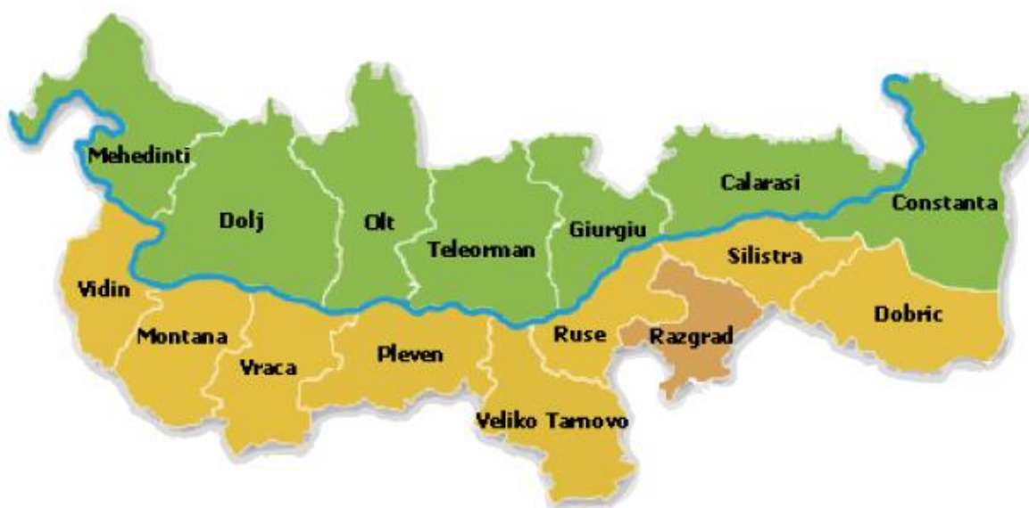
Figure 1: Map of the eligible area

The Operational Programme is financially large : it has a total budget of EUR 255,189,999 million, to which the European Union contributes with an ERDF amount of EUR 213,413,977 million (this compares to an average of EUR 100 million for Strand A programmes).